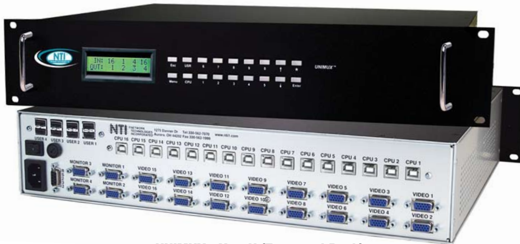
UNIMUX-4X16-U (Front and Back)

Up to eight users can control 32 USB-enabled PC, SUN and MAC computers